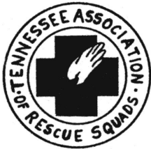
Early Drawing Of Association Emblem: The official logo for TARS was developed and adopted between 1955 & 1957. It is widely held that the design featured the green Greek cross due to its being recognized as the international life saving and safety symbol and a Dove's wing superimposed to signify the Hand of God in the work that the squads would undertake. The logo was finally researched and successfully listed as the Registered Trademark for TARS in the late 1990's in Washington D.C.

The next installment will focus on 1971-1990. The creation of the TARS State Office, The TARS State Tours, and the TARS/EMS Vehicle Extrication program.