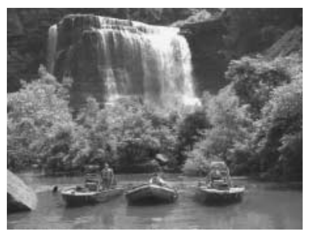
Spotlight on... Putnam County Rescue Squad article continued on page 8