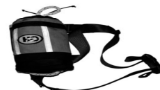
Sharpshooter Throw Bag