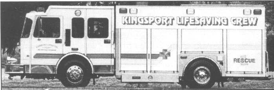
At Left - One of KLSC's two heavy rescue units.