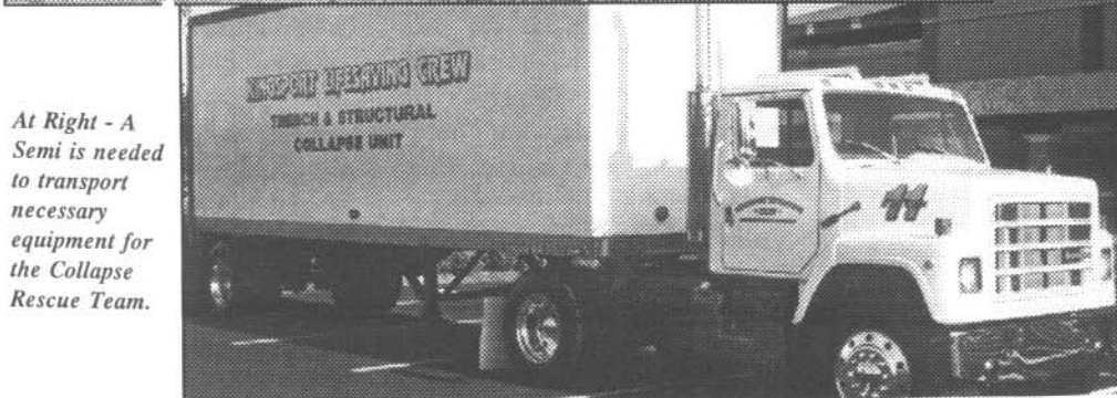
At Right - A Semi is needed to transport necessary equipment for the Collapse Rescue Team.

Kingsport, Tennessee is located in the upper northeast area of our state (bordering Virginia) principally in the County of Sullivan, although the city limits encompass a portion of neighboring Hawkins County as well. The city of Kingsport has a population of around 37,000, of Sullivan County's approximately 144,000 citizens, and is commonly referred to as the 'Tri-Cities' area since Kingsport, Bristol, and Johnson City all border each other and together represent the fifth largest population area of the state.